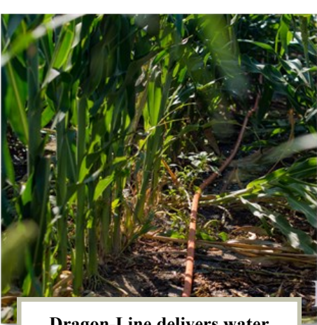
Dragon-Line delivers water directly to the soil in one of T&O's demonstration fields.