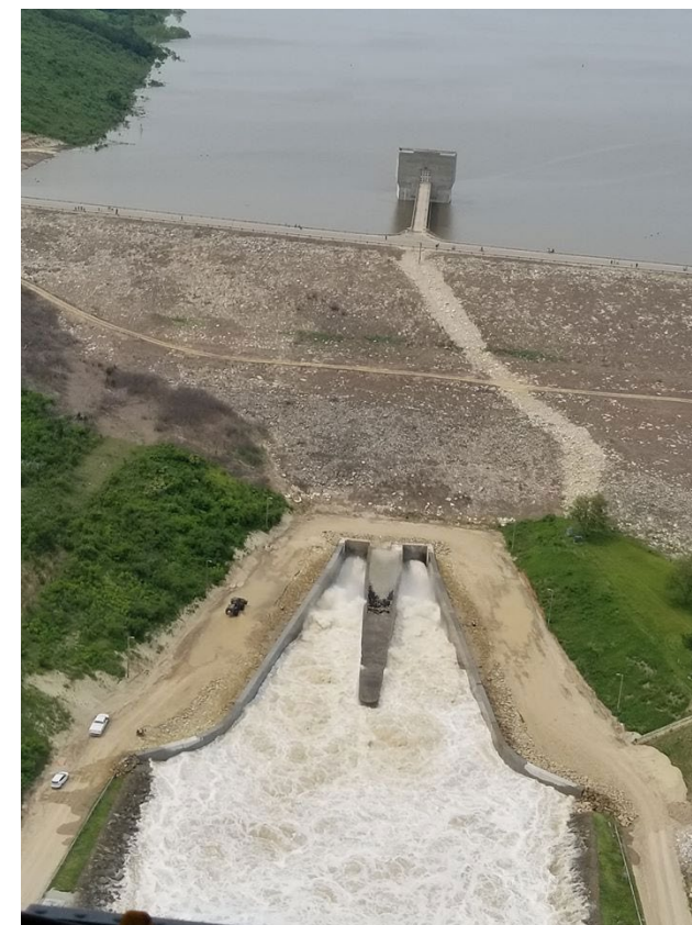
Tuttle Creek Dam, 30,000 cfs discharge May 31, 2019